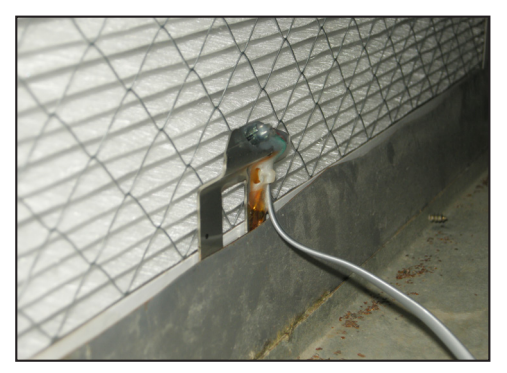
Sensor bracket installed in air handling unit filter tray.