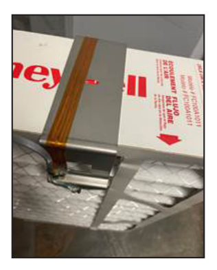
Sensor bracket installed on 4 inch filter.