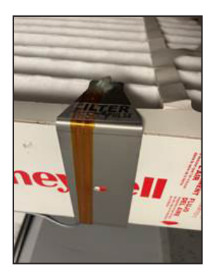
Sensor bracket installed on 2 inch filter.