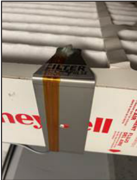
Sensor bracket installed on 2 inch filter.