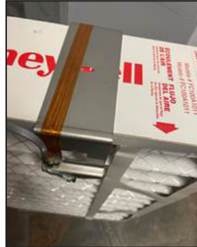
Sensor bracket installed on 4 inch filter.