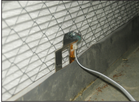
Sensor bracket installed in air handling unit filter tray.